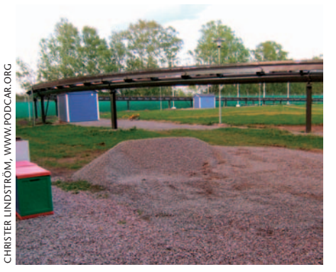
Innovative modes of mass transport powered by renewable energy would offer great benefits over advances like biofuels that perpetuate our reliance on energy-inefficient, gridlock-bound cars. Sweden, for instance, is testing a podcar system.

Can we move people more safely and efficiently? Yes, we can. By using grade separation to keep riders several feet above