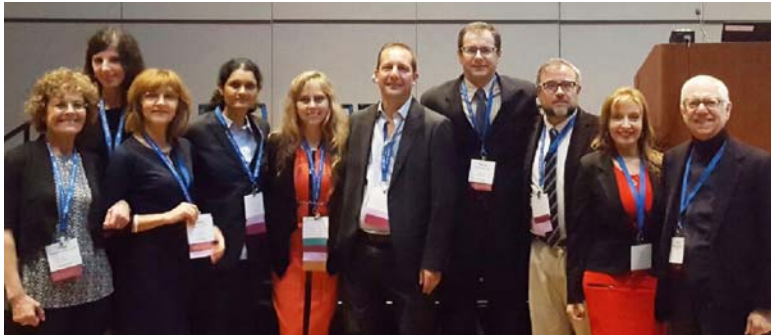
(L image) World medical conferences and international forums unite multidisciplinary experts to continue global info-sharing

"The COVID-19 pandemic has demonstrated the interconnected nature of our world – and that no one is safe until everyone is safe. Only by acting in solidarity can communities save lives and overcome the devastating socio-economic impacts of the virus. In partnership with the United Nations, people around the world are showing acts of humanity, inspiring hope for a better future." - United Nations